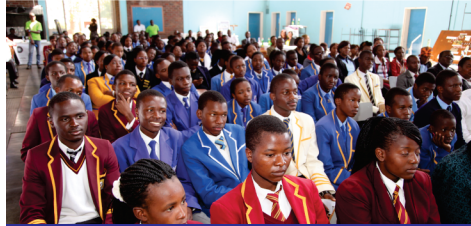
Students from the various high schools who attended conference.