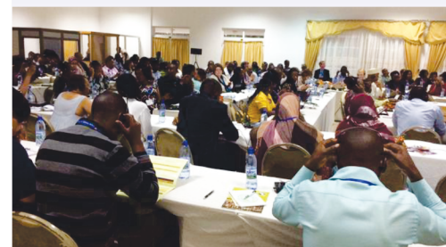
Delegates attending the AFLIA Conference in Ghana