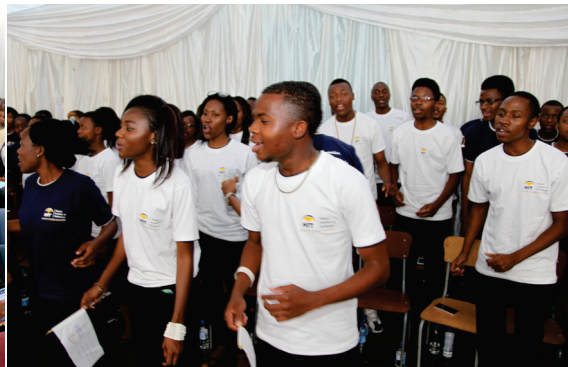
Part of the gathering at the HIT 10th Anniversary Celebrations entertained by the phenomenal HIT choir.