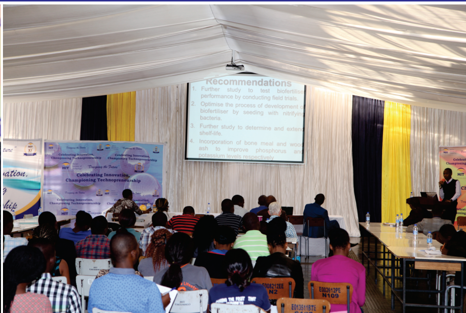
Part of the key speakers and the public workshops held from 24 to 26 August 2015 to mark the HIT 10 th Anniversary Celebrations. The workshops were centred on various technologies and were hosted by Institute's schools.

H arare Institute of Technology's 10 th Anniversary Celebrations were marked by several public workshops from 24 to 26 August 2015. The workshops were centred on various technologies and were hosted by the Schools of Engineering and Technology, Industrial Sciences and Technology and Information Science and Technology Business and Management Sciences.