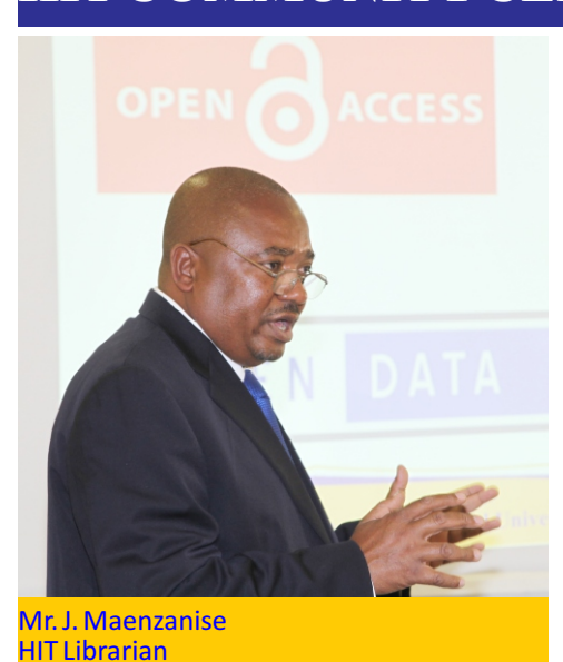
he HIT community celebrated Open Access Week from 19 to 23 October, under the theme: "Open for Collaboration".

The week –long celebrations were led by the HIT Library and were held as part of the 10<sup>th</sup> Anniversary celebrations.