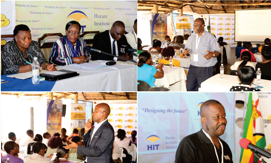
Delegates, facilitators and participants at the Women Entrepreneurship Development (WEDT) Training programme in Gwanda.

A Women Entrepreneurship Development Training (WEDT) programme was conducted by Homelink Finance Services in partnership with the Harare Institute of Technology's Technopreneurship Development Centre (TDC) in Gwanda from 19-23 March 2018 in Gwanda under the theme 'Entrepreneurship Mindset For Sustainable Businesses'.