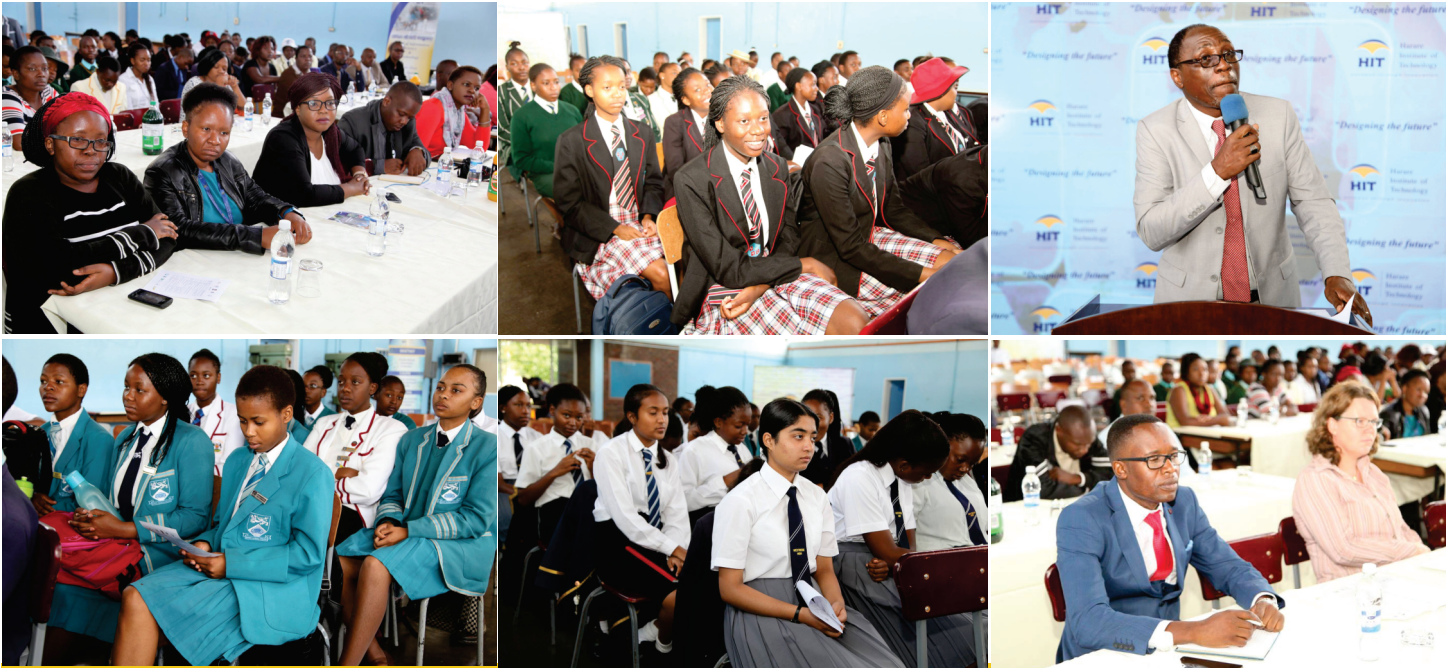
Delegates, presenters and participants at the Women in Technology (WITECH 2018) Event

The first edition of the Women in Technology Event (WITECH 2018) was successfully held at HIT on 8 March 2018 under the theme 'Women in Technology: Working towards Progress for All', as part of the commemorations to mark the International Women's Day.