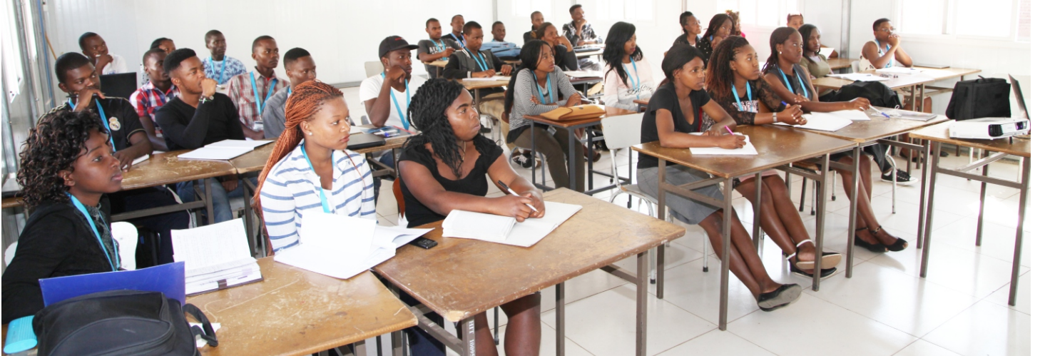
Financial Engineering students in class.