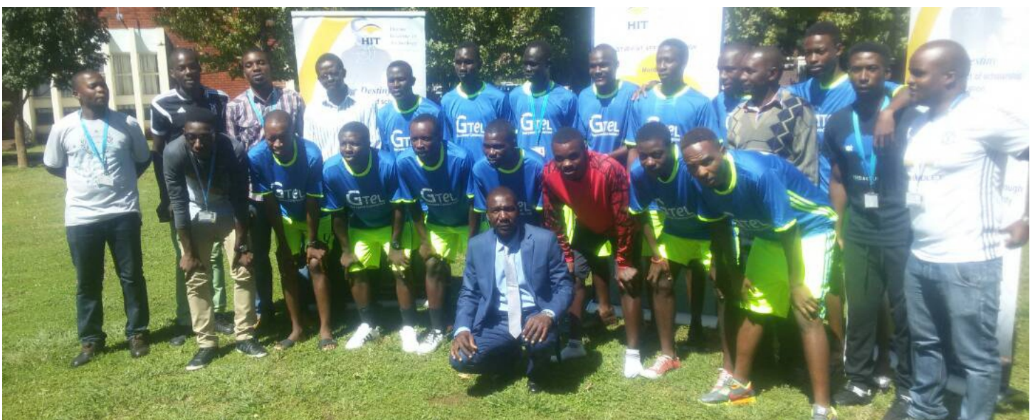
HIT Students Football Team posing for a photo after receiving the kit donation from GTEL.