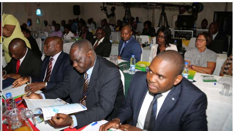
STEM Business luncheon held in Kariba on the 11th of July 2017 in pictures.