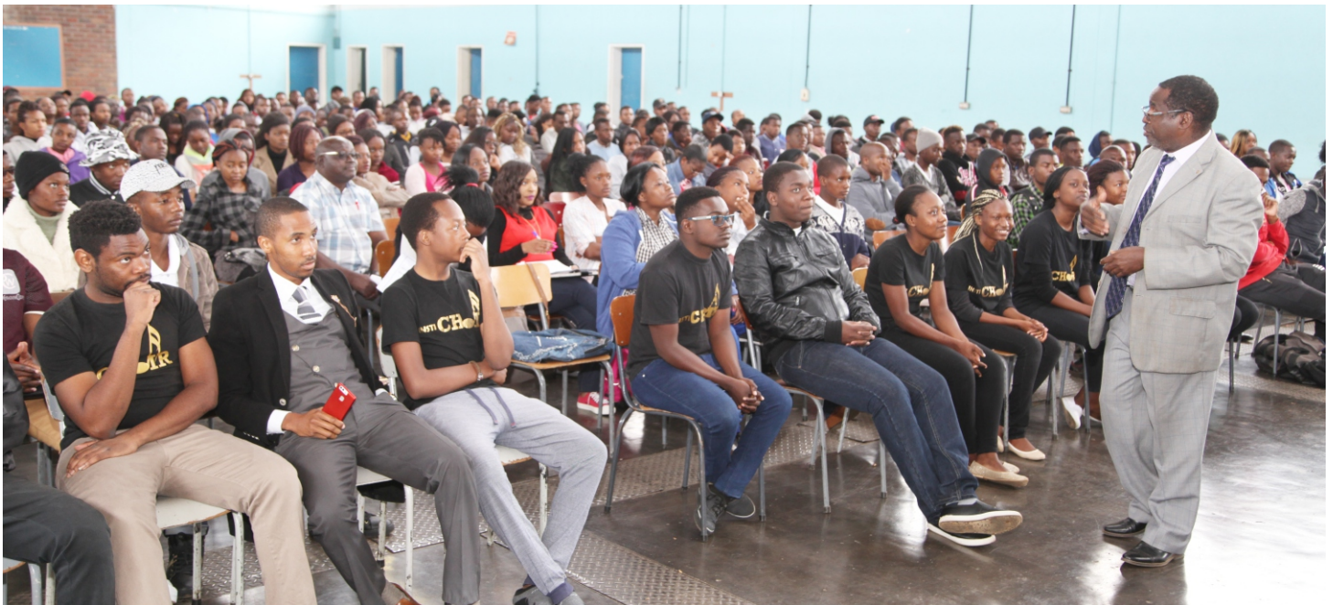
HIT Dean of Students' Affairs addressing students before the start of the first semester for the 2017/18 academic year.