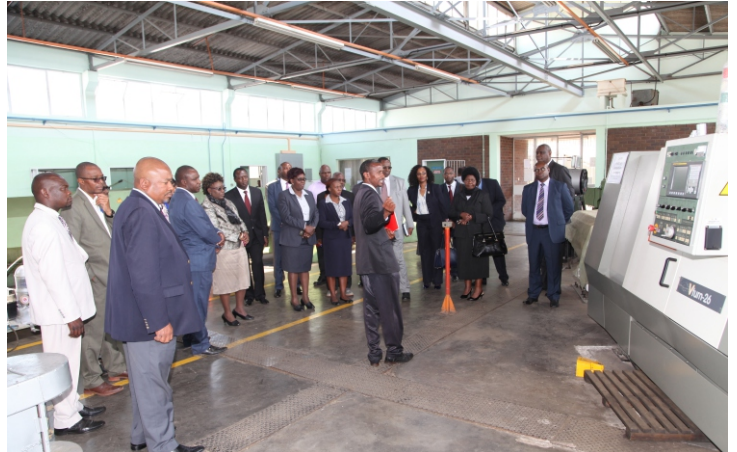
HIT Board members during the induction programme on campus