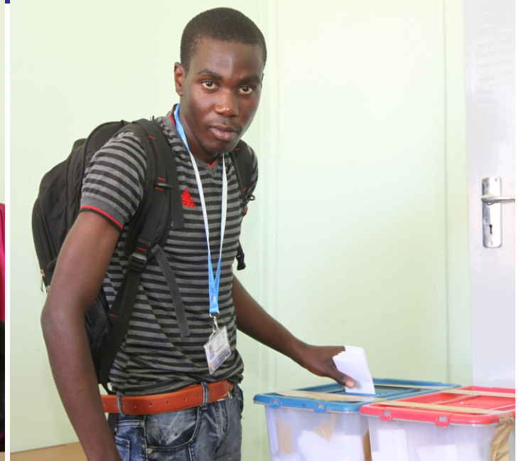
Students voting for the new Student Representative Council for the 2017/18 Academic year.

The 2017 Student Representative Council (SRC) elections were held on Wednesday 30 August 2017 and a new committee was voted into Office for the period 2017/18.