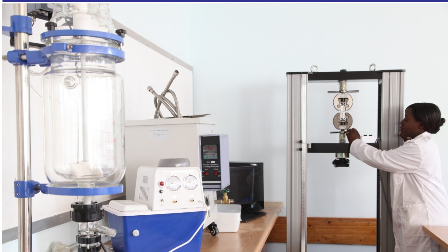
Some of the newly acquired laboratory equipment installed in the Polymer Technology and Engineering Department.

The Polymer Technology and Engineering department has acquired and installed the following laboratory equipment: