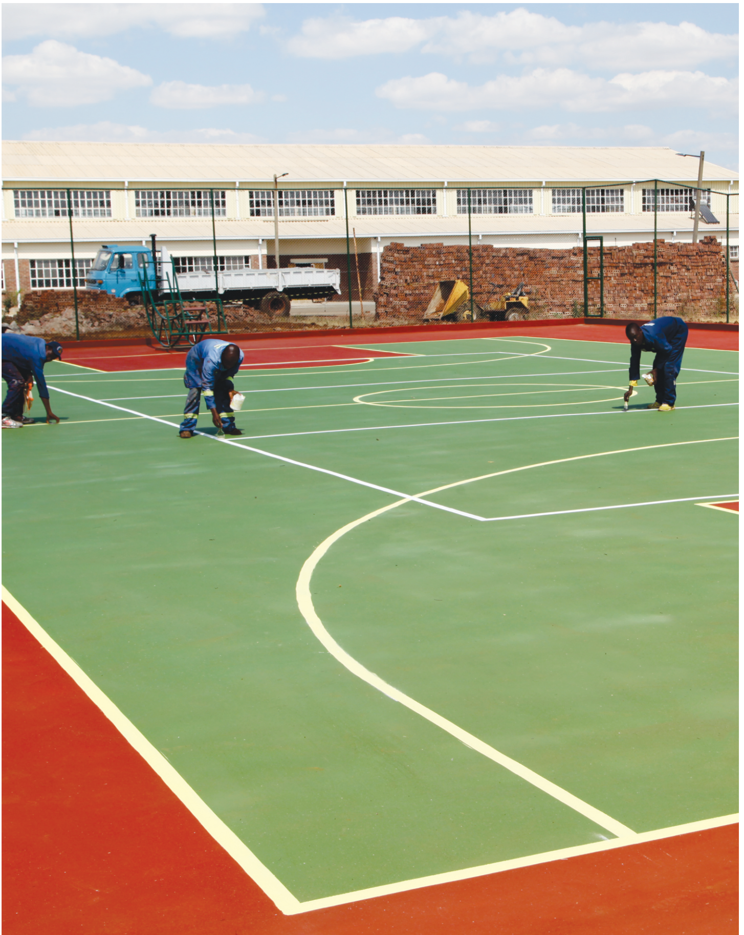
Construction workers putting the final touches to new basketball court recently constructed on campus.